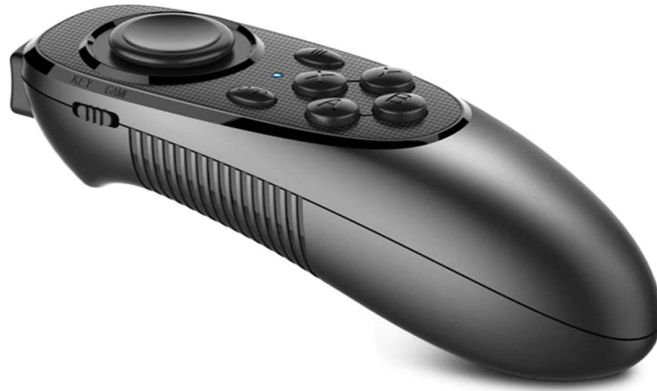
Figure 3. An example of a VR controller