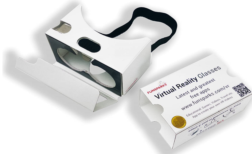
Figure 2. An example of a cardboard VR glasses

The Google VR SDK can be used with different platforms: https://developers.google.com/vr.